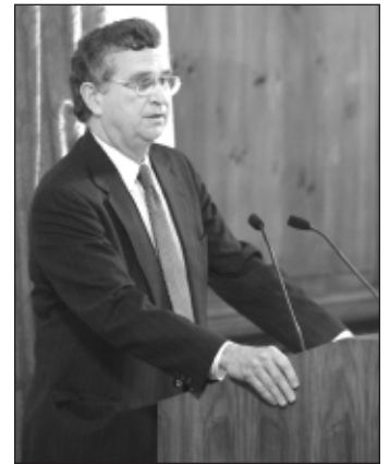
Keynote Speaker The Hon. Hodding Carter III

“What is permanent, however,” Carter continued, “in the building and preserving of a decent civil society is the need for the individual voice of conscience, demanding to be heard, demanding that oppression be lifted, and demanding that human rights be restored... All this most assuredly in Angola or Burma or Russia where the reaction can be lethal. But also assuredly in the United States, where it is not yet truly dangerous, nor likely to be tomorrow. But where it could be soon enough if we stand mute as an overweening state flaunts the rule of law, national and international, in the name of society.” In closing, Carter said, “Rafael Marques, you are our exemplar, our reminder that bearing witness is the first requirement of an open society.”