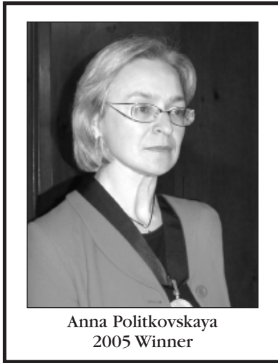
Anna Politkovskaya 2005 Winner