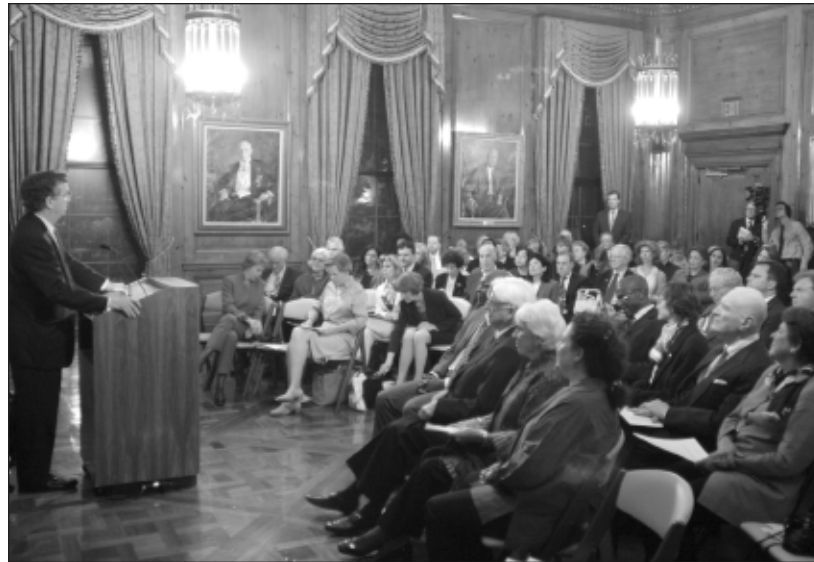
The Civil Courage Prize Ceremony, Oct. 18, 2006, at the Harold Pratt House, New York City